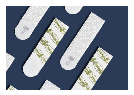
Option #2. 3M Command strips. These are easily available from most hardware stores. Use enough strips to support the weight of your Metal Art. (For indoor use only)

Option #3. Choose the 20mm Standoff Wall Mounts to create a 3 dimensional display of colour and shadows. When you choose this option, we will change the mounting holes to 9.00 mm (suitable for the wall mounts.)